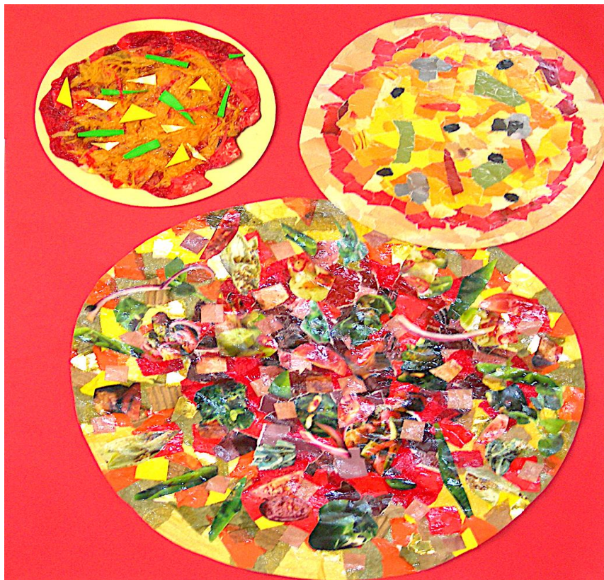
Celebration Pizza Designs, Photo-credit: June Bianchi