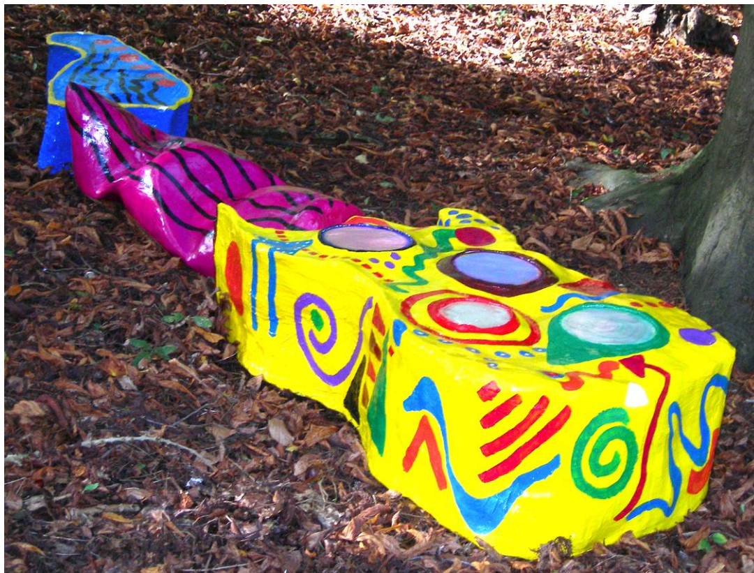
Recycled Sound Sculpture