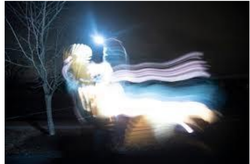
Silhouette Movement (CC0 Public Domain)

https://commons.wikimedia.org/wiki/File:Silhouette_1330272.svg