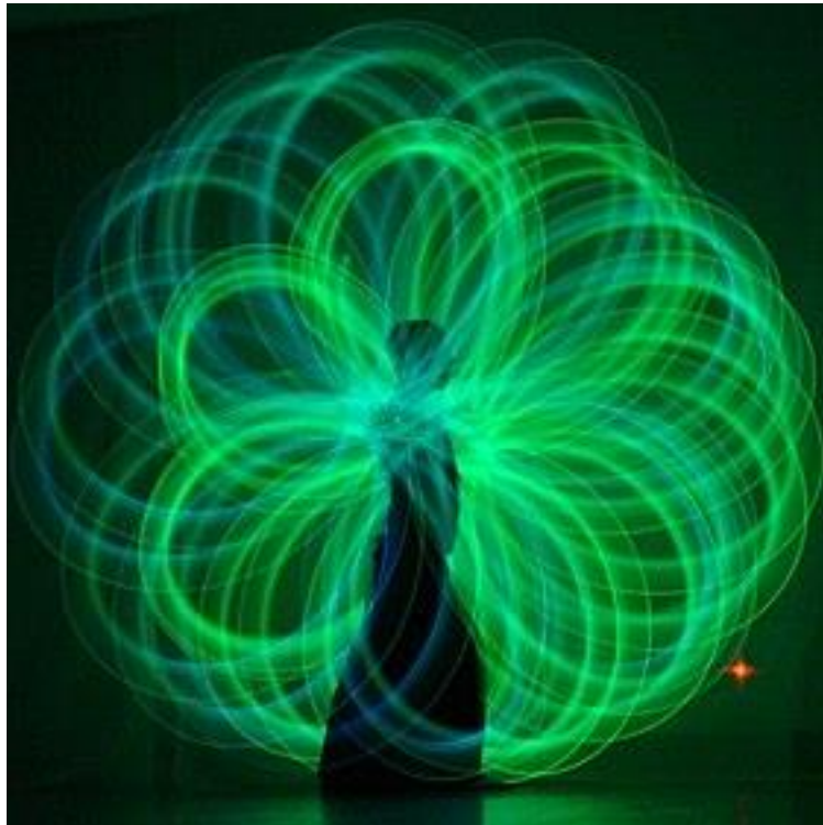
Performance art (CC0 Public Domain) https://en.wikipedia.org/wiki/Poi