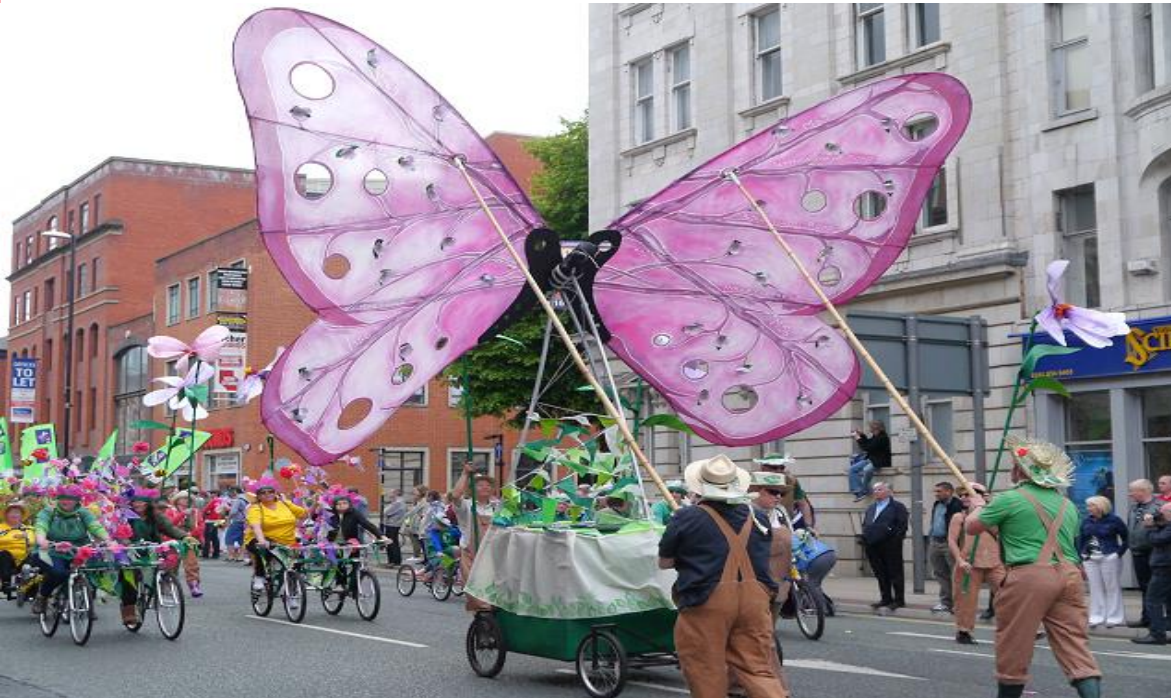
Manchester Carnival