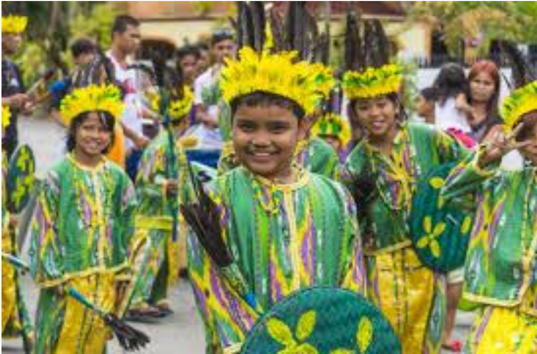
Carnival dance https://pxhere.com/en/photo/687760

Join in with these rhythms and dance moves: