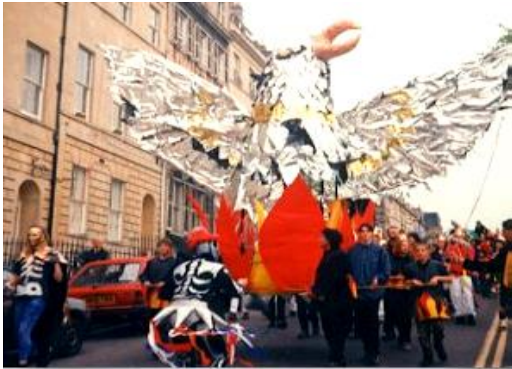
Bath Carnival Procession: collaboration between Bath Spa University and local schools.