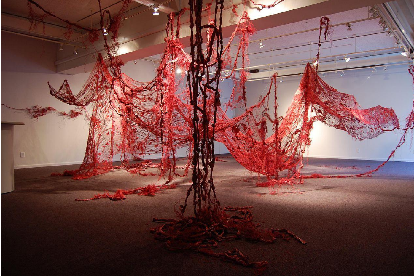
Nnenna Okore (CCPD)

https://upload.wikimedia.org/wikipedia/en/a/a8/Life_force_installation_view.jpg