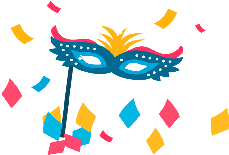
Carnival mask