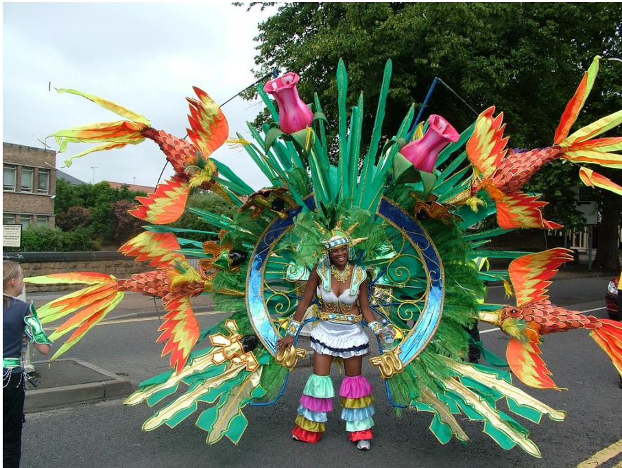
Carnival Costume (CC BY 3.0)

https://commons.wikimedia.org/wiki/File:Nottingham_Carnival_Costume.jpg