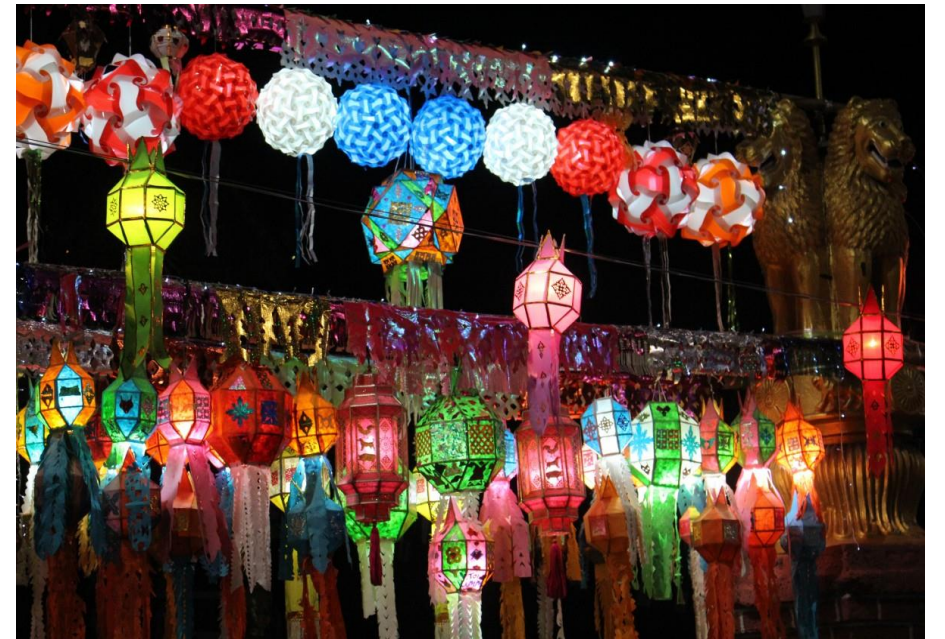
Lantern Festival