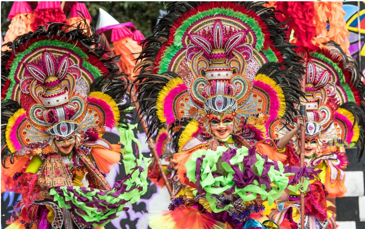
Masskara Festival