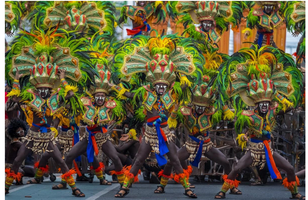
Philippine Carnival