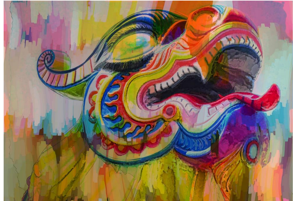
Carnival Dragon Head https://www.publicdomainpictures.net/en/view-image.php?image=255521&picture=carnival-dragon-head